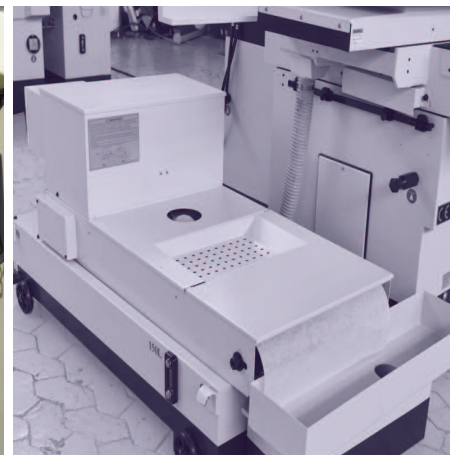
Paper filter system