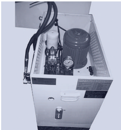
Hydraulic power pack